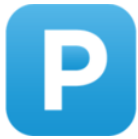
PowerChart Touch (PC Touch)