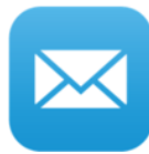
Cerner Message Center